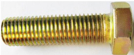
Zinc plated fastener